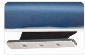
TABLE EXTENDER #63487-T*