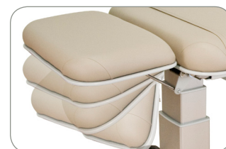
4 Position Leg Section