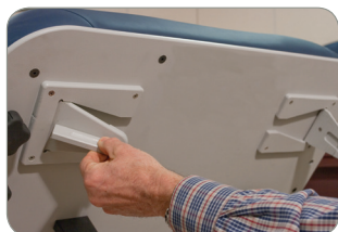
Paper Roll Holder folds out of the way