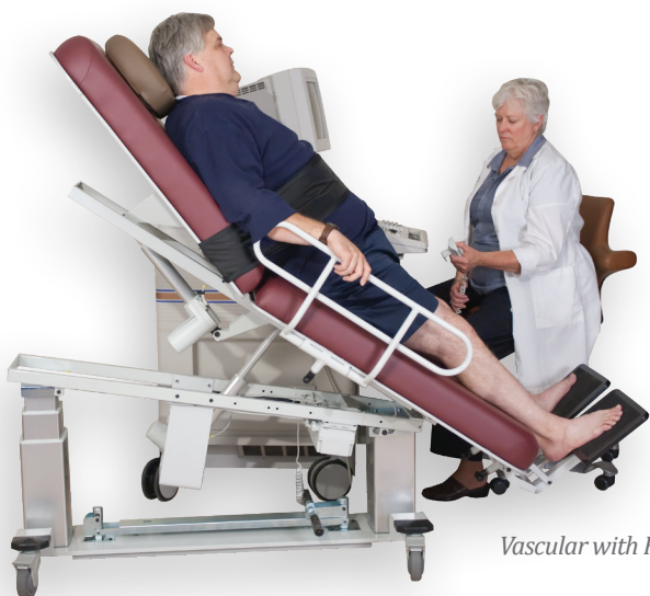
Vascular with Fowler

Inspired by the leading ergonomic experts in sonography