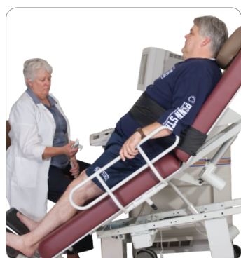
Easy Hand Control Adjustments Up To 70° Reverse Trendelenburg