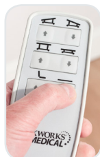
Multi-Function Hand Control