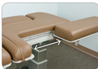
Sliding Cardio Panel opens as wide as 15" (38cm)