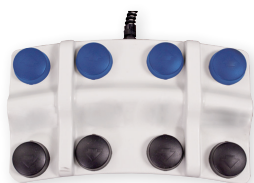
Multi-Function Foot Control

Option: All Exam Tables & Procedure Chairs