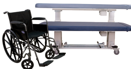
22" - 38" Height Range