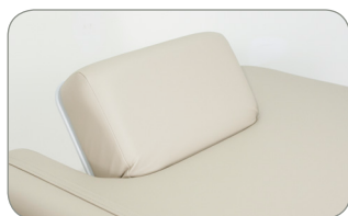
Adjustable Access Back Support