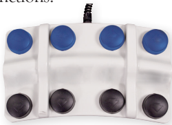
Multi-function foot control

You can add a foot control that controls all functions.