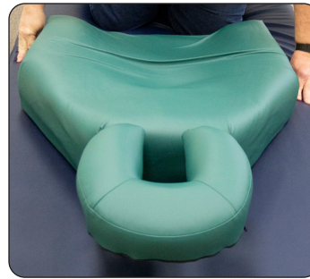
Recessed area conforms to the patient, cradling and easing patient breathing