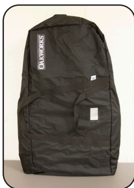
OPTIONAL Storage Case Part No. 0210

made in the USA with US & imported parts