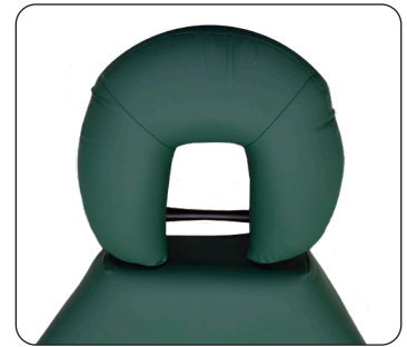
Excellent accessibility to the patients face for nasal cannula