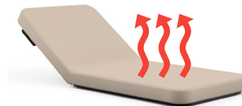
Integrated Heated Top (Optional)

Our new system is imbedded in the foam, creating a more even heat, and has three settings. Designed originally to be used in car seats and hospital beds, the heating element automatically shuts off after 10 hours providing peace of mind for safety and energy conservation.