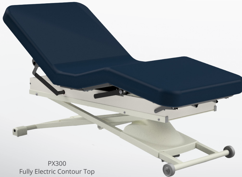
PX300 Fully Electric Contour Top

The PX line of exam tables feature rock solid support and excellent ergonomics with their twin x beam construction. With a low starting height and a powered range of 18", patient transfers and optimal caregiver ergonomics are facilitated with its barrier free open design. With three top choices and two foam options, the perfect solution for your needs can be found.